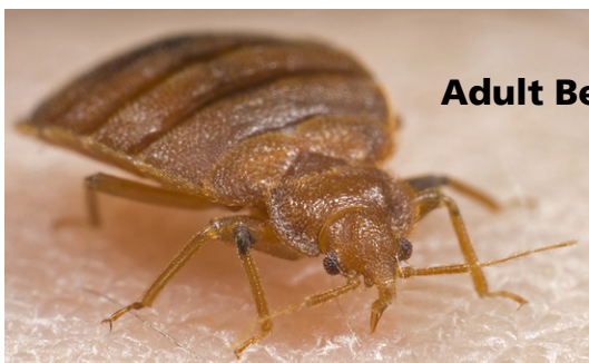
Adult Bed Bug

How are bedbugs brought onto campus? Bedbugs are generally not carried on your person, but they can be carried in personal possessions such as bedding, suitcases, backpacks, boxes, and furniture.