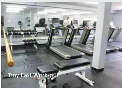
Troy East Work-out

Some building types, such as the residence halls and suite-style buildings, as well as Honors House have required full meal plans. Cardinal Gardens, Century, Parkside Apartments and Webb Tower have required partial meal plans for upperclassmen. For more information check our website.