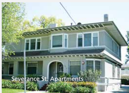
Severance St. Apartments