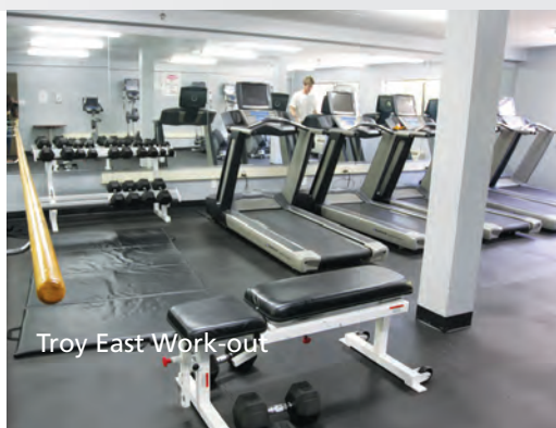
Troy East Work-out

Some building types, such as the residence halls and suite-style buildings have required full meal plans. Cardinal Gardens, Century, Parkside Apartments and Webb Tower have required partial meal plans for upperclassmen. For more information check our website.