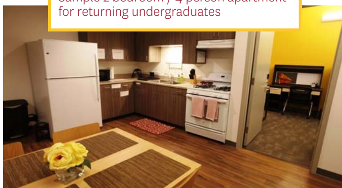
Sample 2 bedroom / 4 person apartment for returning undergraduates

Students living in USC Housing for 2016-17, beginning with current freshmen, will have priority to live in the Village through the Housing Renewal program beginning in January 2017. Continuing non-residents and transfers may also apply beginning in February 2017.