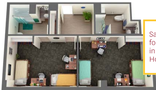
Sample floor plan for 4 person suite in McCarthy Honors College